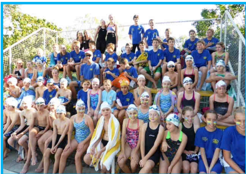
The Holland Park Team

The results from the Carnival are under Club Results on the website.