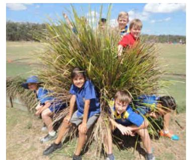
A Blooming Touch Tree

The training focus has been the role of the ‘Dummy half’ in the game and the importance of using this role effectively in our games. They boys have all worked hard and are implementing their training in their